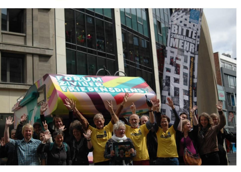
In 2013, the Peacemobile (here in Cologne) toured Germany for the Civil Peace Service.