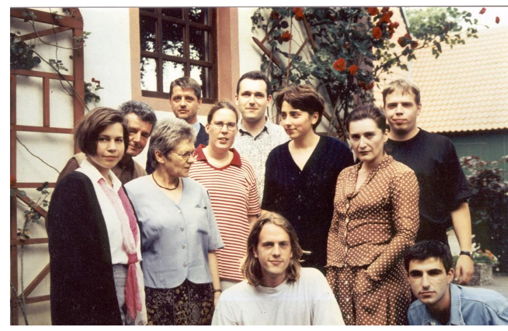
Participants in the second CPS training course in 1998.

Helga Tempel : But we shouldn't forget just how much conceptual work went into the planning. Konrad Tempel had developed a 40-page, one-year training plan that built on the ideas of many of the pioneers of non-violent action. A central concept of this extensive curriculum has remained in place to this day: reflecting on one's own conflict behaviour within the group should form part of the training.