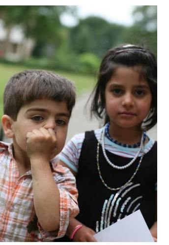
Municipal conflict consulting helps to enable children to grow up in a peaceful environment.

It is not the first time that Osterholz-Scharmbeck has made the headlines in connection with violence among migrants. Particularly the area around Drosselstraße has become known beyond the town's borders as a social flashpoint with high potential for violence. The residential area was built in the late 1970s when US American soldiers were stationed here. When the military base was relocated in 1992, the inhabitant structure changed. Particularly refugee families from Turkey, Lebanon and Syria moved here. And now a family from Osterholz-Scharmbeck was once again involved in an act of violence among migrants. But this time the story ended differently: to help combat criminality in the region, the town's prevention committee asked forumZFD for help solving the problems there using municipal conflict consulting approaches.